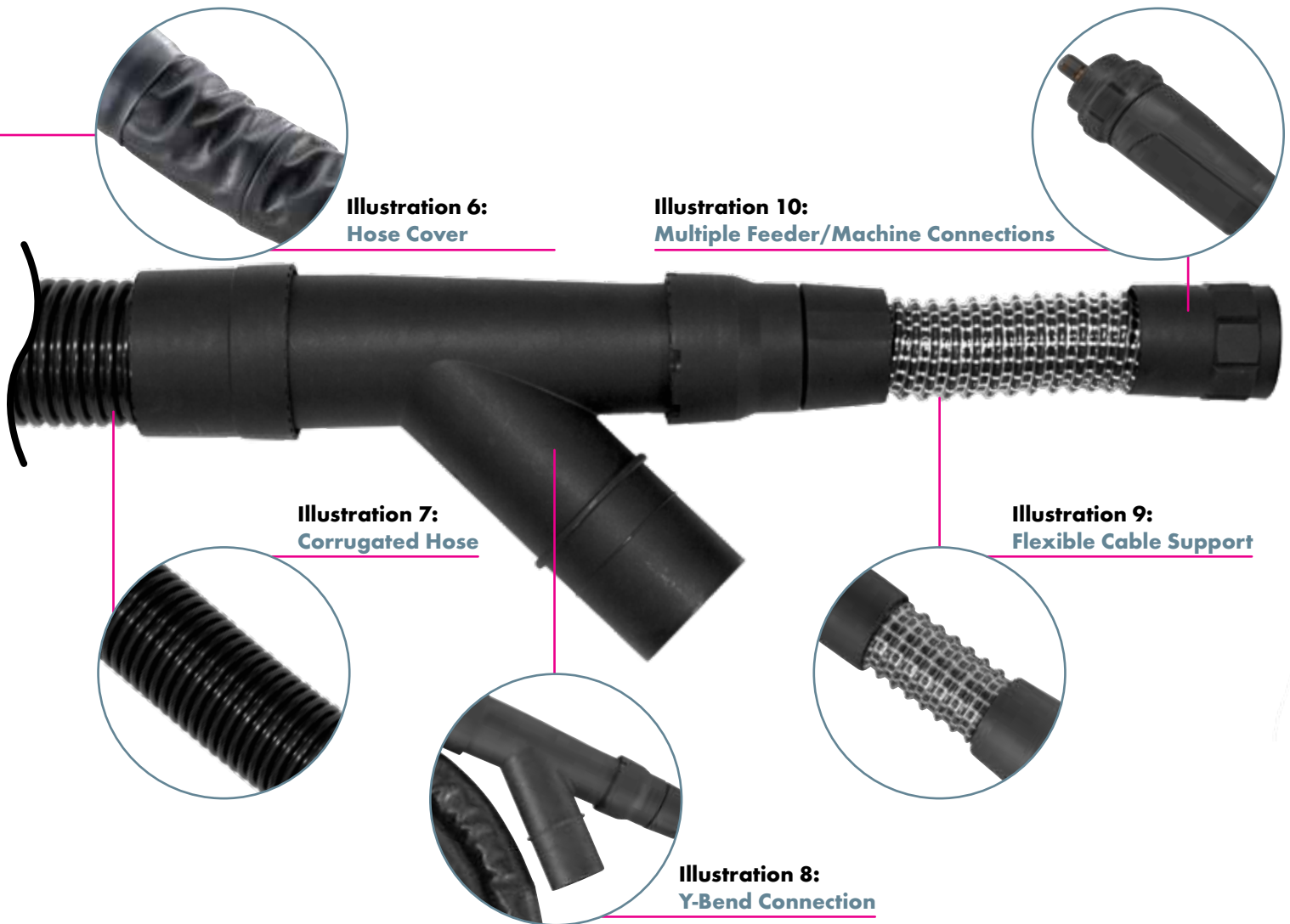
Illustration 6: Hose Cover