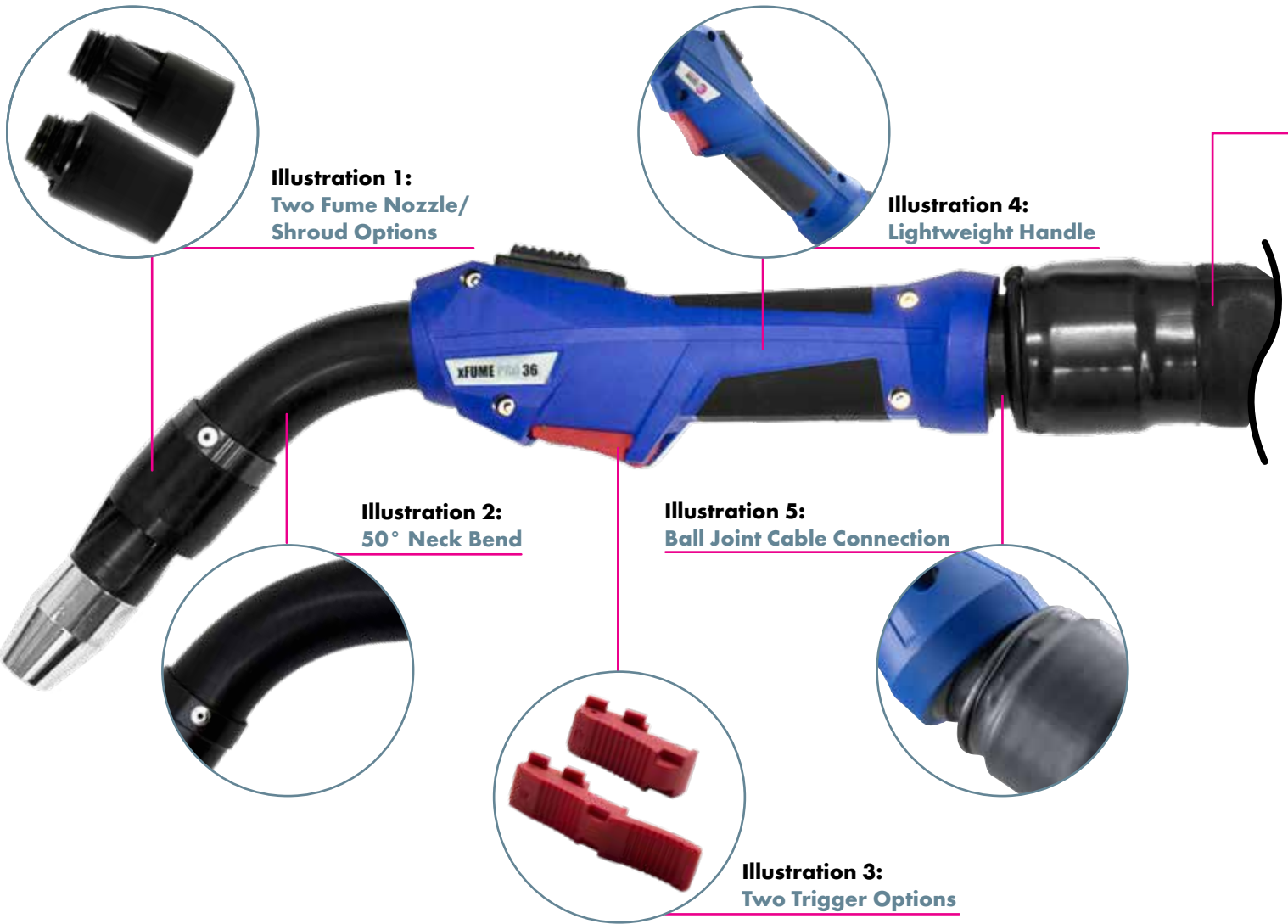
Illustration 1: Two Fume Nozzle/ Shroud Options