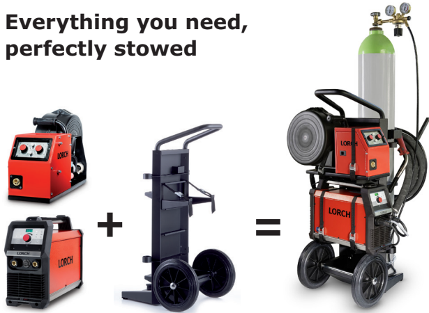
Wire feeder case, custom fit above the MX350.