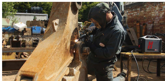
Maintenance and repair