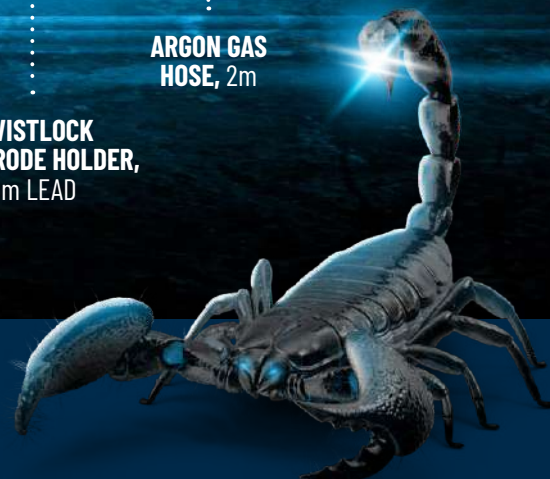
MIG GUN WITH EURO CONNECTION, 3m